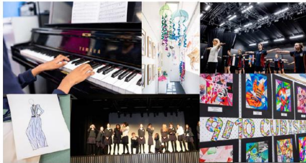
Dance | Photography | Visual Arts | Media | Design & Graphics | Music | Vocal | Drama | Textiles

https://events.humanitix.com/creative-and-performing-arts-showcase-semester-1